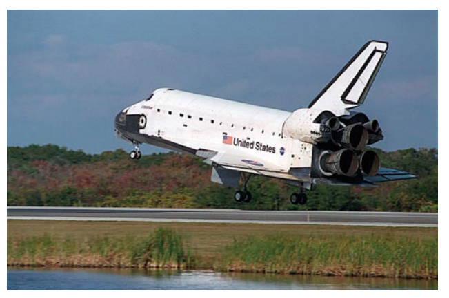
Endeavour lands Dec. 7, 2002, at KSC's Shuttle Landing Facility after the 14-day mission STS-113 to the International Space Station.