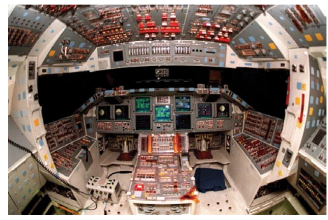
The "glass cockpit" provides easy-to-read, graphic portrayals of key flight indicators like attitude, altitude and speed.

Both Discovery and Atlantis have received the new full-color, flat, 11-panel multifunction electronic display subsystem. The new system improves crew/orbiter interaction with easy-to-read, graphic