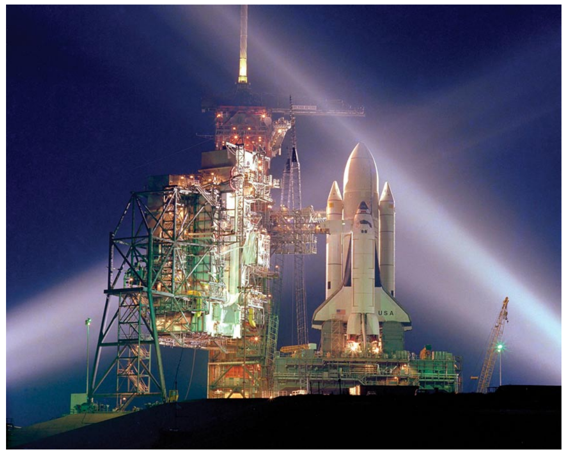
Columbia sits on Launch Pad 39A before its maiden flight on STS-1, April 12, 1981.